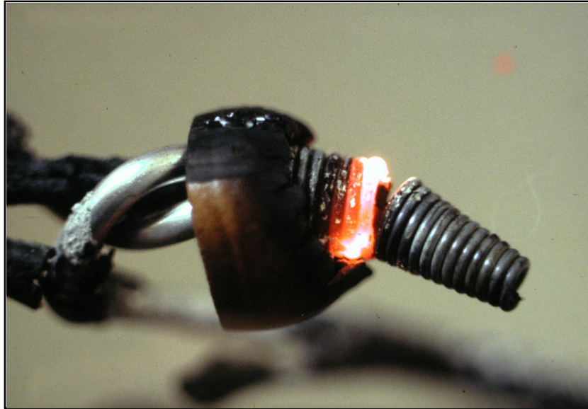
FIGURE 1 - ALUMINUM WIRE SPLICES MADE WITH TWIST-ON CONNECTORS CAN BE DANGEROUS. The use of most types of twist-on connectors with aluminum wire can lead to hazardous results. This twist-on pigtail connection (two #10 aluminum wires with one #12 copper wire, in a 20-amp circuit), made with a twist-on connector that was UL listed for use with aluminum wire at the time, remains electrically functional in the circuit, but it becomes extremely hot whenever a significant amount of current flows. The heat has deteriorated the insulation on both the connector and the wires. In this photo, a portion of the connector's spring is red hot, at current well below the circuit rating.