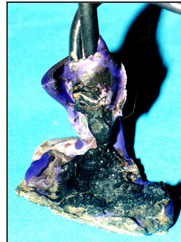
B. Severe failure, plastic shell melted and charred. The charring indicates that it had probably ignited.