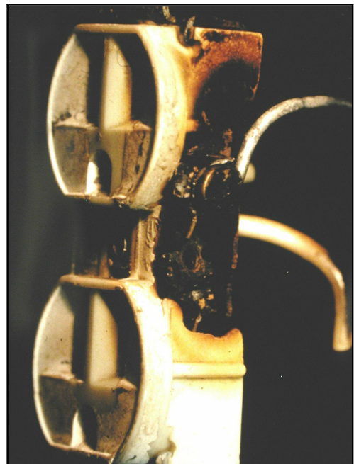
FIGURE 2 - EXAMPLE: OVERHEATING OF ALUMINUM-WIRED TERMINALS ON A RECEPTACLE. Enough heat was generated by current flowing through the aluminum wire connections to cause charring of the receptacle body and disintegration of the insulation that was on the wire. Note that the face of the receptacle, as the homeowner or an inspector would have seen it, with the cover plate on, would look normal.