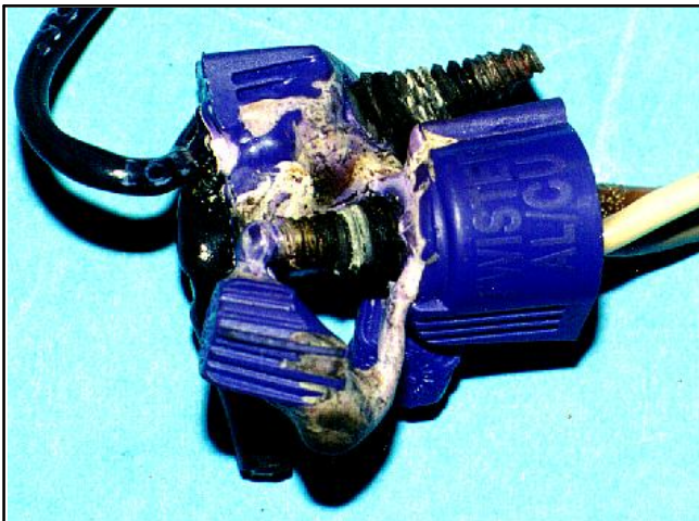
A. These two failed splices are adhered together by the melted plastic insulating shells.

Additionally, field burnouts have now been reported with the Ideal #65 connectors in their rated applications. With CPSC skeptical (and requesting that UL withdraw its listing), the manufacturer initially agreeing that the connector is not for the pigtail retrofit application, independent tests clearly demonstrating poor performance, and field failures reported, the use of the Ideal #65 "Twister" connector for the pigtail application is definitely not recommended. If the COPALUM repair is not available, use the AlumiConn connector (See Section 1C).